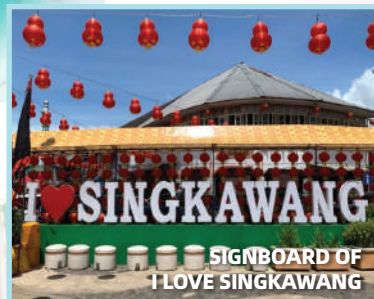
SIGNBOARD OF I LOVE SINGKAWANG