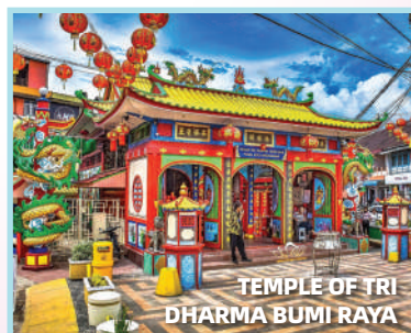
TEMPLE OF TRI DHARMA BUMI RAYA