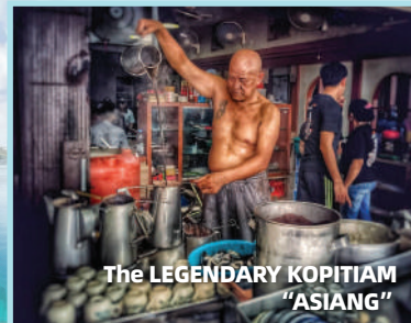
The LEGENDARY KOPITIAM "ASIANG"