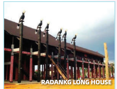
RADANKG LONG HOUSE

❖ FLIGHT DETAILS: TR341 PNK - SIN 1235/1500