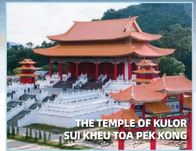
THE TEMPLE OF KULOR SUI KHEU TOA PEK KONG

Hotel : Novotel Pontianak City Center / Golden Tulip / Similiar 4*