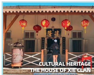
CULTURAL HERITAGE THE HOUSE OF XIE CLAN