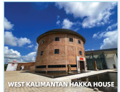
WEST KALIMANTAN HAKKA HOUSE