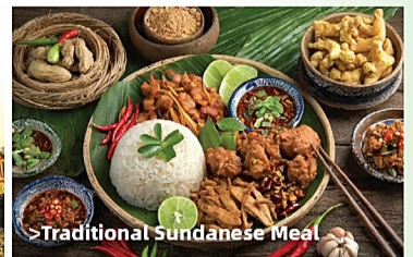
> Traditional Sundanese Meal

Remarks: In the event of any discrepancies, please refer to the English version. 如有任何差异，请以英文版本为准。