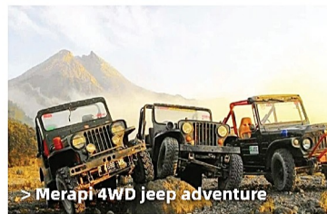
> Merapi 4WD jeep adventure

❖ FLIGHT DETAILS: TR229 YIA-SIN 1850/2215