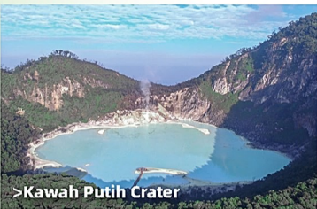
> Kawah Putih Crater