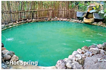
> Hot Spring