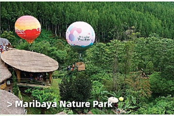
> Maribaya Nature Park