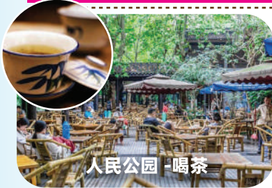
人民公园 - 喝茶

👉 浣花溪智选假日酒店 (4*) 或同级 Holiday Inn Express Chengdu Huanhuaxi or similar 4★ Hotel