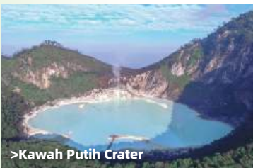
> Kawah Putih Crater