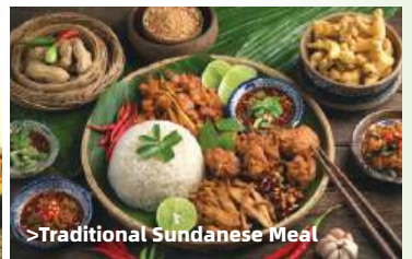
> Traditional Sundanese Meal

Remarks: In the event of any discrepancies, please refer to the English version. 如有任何差异，请以英文版本为准。