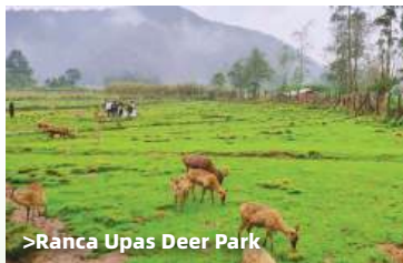
> Ranca Upas Deer Park