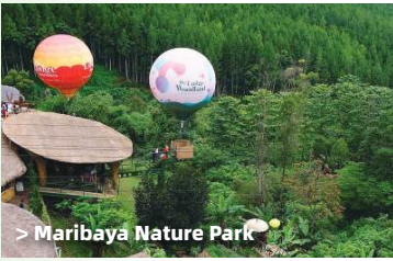
> Maribaya Nature Park