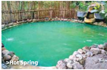
> Hot Spring