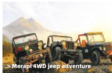
> Merapi 4WD jeep adventure

❖ FLIGHT DETAILS: TR229 YIA-SIN 1850/2215